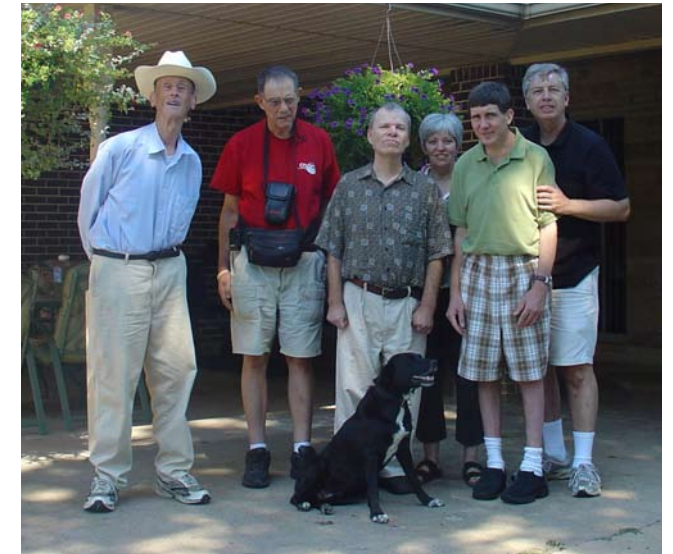
Companions and friends at Oakwood.

Without your valued support, the Camphill Foundation's efforts to assist Camphill communities large and small would be impossible. Your donations, have made it possible for the Foundation to successfully disburse over $10.5 million in grants, gifts, and low-interest loans to help new Camphill communities prosper and flourish since we began our work in 1966. Your financial contributions foster their strength of life-sharing relationships, their love and stewardship of the land, the pioneering sustainable practices that serve as models for the greater community, and the freedom of individual spirit that is the essence of Camphill. We look forward to new initiatives and affiliate communities and the continued expansion of the Camphill Movement in North America.