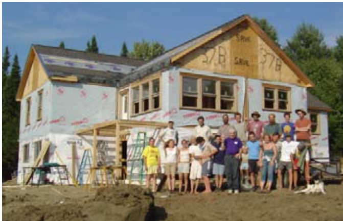
Construction team of Heartbeet's new house.

Camphill is dedicated to social renewal through community building with children, youth and adults with disabilities.